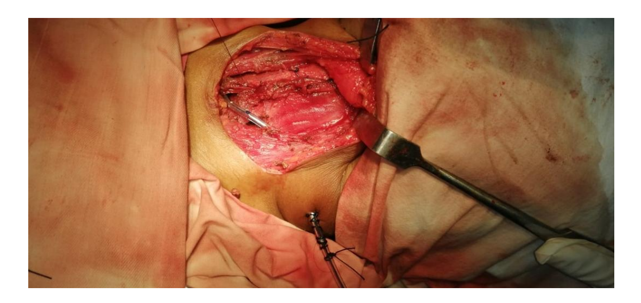
Thyroidectomy done in operation theatre of DHQ Hospital, Rawalpindi

Disability certificate is given to disabled two days a week after thoroughly examining and co-relating investigation of patients.