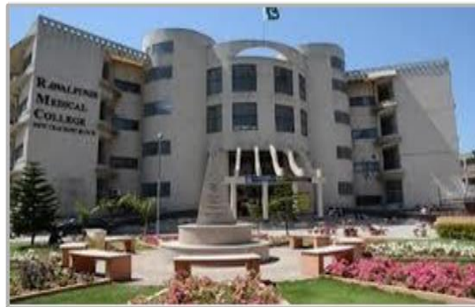
Rawalpindi Medical University, Rawalpindi