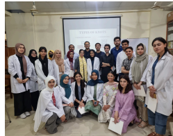
AL NAFEEES MEDICAL COLLEGE 7TH MAY, 2024