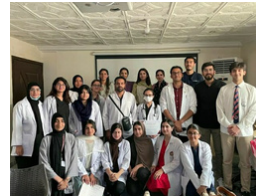
HBS MEDICAL COLLEGE 9TH MAY, 2024