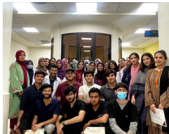
FEDERAL MEDICAL AND DENTAL COLLEGE 15TH MAY, 2024