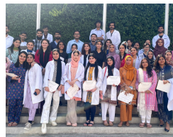
FOUNDATION MEDICAL COLLEGE 11TH MAY, 2024