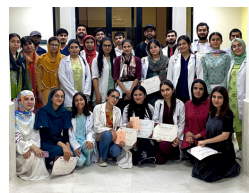
FAZIA MEDICAL COLLEGE 4TH JUNE, 2024