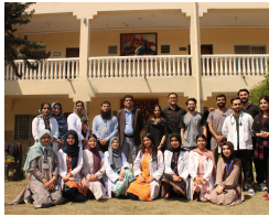
RAWAL INSTITUTE OF HEALTH SCIENCES 23RD APRIL, 2024