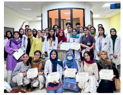
RAWALPINDI MEDICAL UNIVERSITY 1ST JUNE, 2024