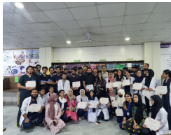
WATIM MEDICAL AND DENTAL COLLEGE 14TH MAY, 2024