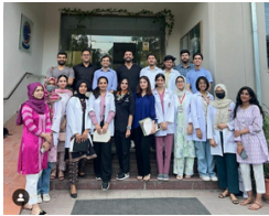
SHIFA COLLEGE OF MEDICINE 23RD APRIL, 2024

Round 1 of the Live Tissue Suturing Competition and Workshop, organized by the Suturing Department, was impactful event spanning 10 medical universities across Islamabad and Rawalpindi. Participating institutions included Shifa College of Medicine, Rawal Institute of Health Sciences, and Foundation Medical College, among others. The primary objective of the workshop was to equip medical students with the confidence and competence in suturing skills essential for providing the best possible patient care. Mentors from the Surgery Interest Group at RMU (SIG-RMU) guided participants through the basics of suturing, teaching four different suture techniques. This foundational training aimed to build students' proficiency and ensure they are well-prepared for clinical situations. The workshop culminated in a competition, from which the top three participants were shortlisted to advance to Round 2, scheduled for mid-July. As one of the largest workshop series organized by the Surgery Interest Group, this event saw over 300 participants actively engaging and mastering the art of suturing, significantly enhancing their practical skills and confidence.