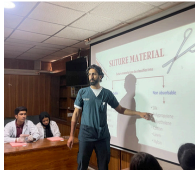
14TH JUNE, 23 NTB Edition