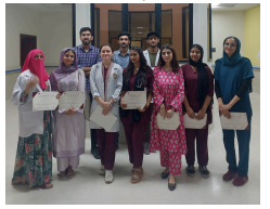
RIPAH INTERNATIONAL COLLEGE 30TH MAY, 2024