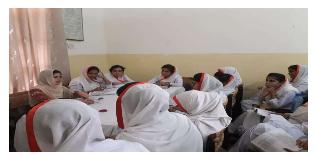
Provision of Family planning services to others departments:-

Regular training sessions are organized for nurses, LHV, Midwives at all family health clinics from time to time.