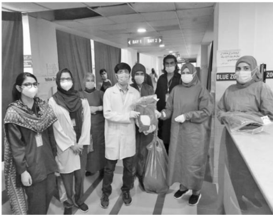
یونیورسٹی طلباء و طالبات خانگی کنس ہسپتال کے لئے گودے رہے ہیں