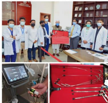
MEDICAL INSTRUMENTS DONATION