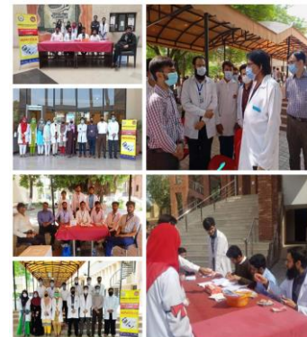
HEPATITIS B VACCINATION CAMPS