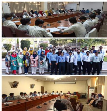
EXECUTIVE BODY MEETING